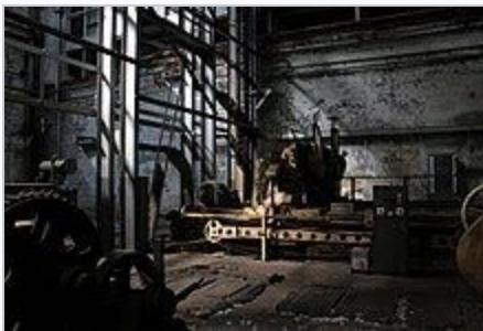
Inside the Heavy Machine Shop at Cockatoo Island by Matthew Machado

The quality of the Australian finalists for Wiki Loves Monuments 2019 remained high. The photo taking out Australian overall winner was a photograph by Matthew Machado, taken from inside the heavy machine shop on Cockatoo Island, or Wareamah , a UNESCO World Heritage Site in Sydney Harbour, New South Wales. The Wiki Loves Monuments challenge attracts contributions from some great photographers, as well as from a team of editors who work on ensuring data from local heritage registers is added to Wikidata, ready for participation in Wiki Loves Monuments.