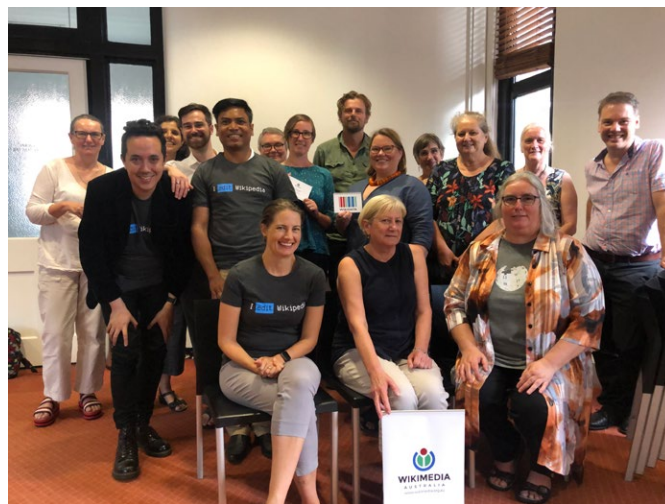
Image: https://wikimedia.org.au/wiki/File:WikiCite_ANZ_2020_group.jpg by Alex Lum

Wikimedia Australia hosted a regional WikiCite workshop, supported by the WikiCite project , on Friday 14 February 2020 in Melbourne. This was a satellite event of the VALA2020 conference, and involved Wikimedians, librarians, researchers and open access advocates who discussed ways to improve the Australian and New Zealand authors, academics and subject areas currently poorly served by Wikidata. Presentations and the report are available.