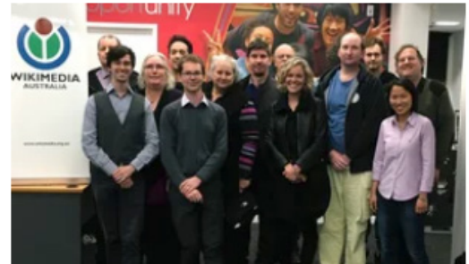
Happy Birthday Wikimedia Australia!